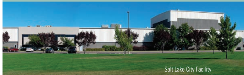
Salt Lake City Facility

Construction began on NCFI's Mount Airy, NC corporate headquarters and manufacturing plant in 1966. The facility, which originally covered 40,000 square feet, has grown to more than 400,000 square feet. In addition to housing much of the company's production and distribution operation, the complex is now home to an advanced technical research and testing laboratory.