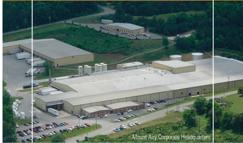
Mount Airy Corporate Headquarters