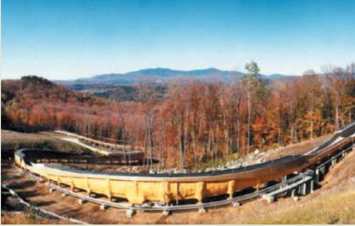
THERMALSTOP INSULATES THE LAKE PLACID BOBSLED RUN.