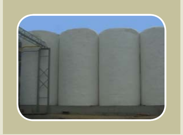
TANK INSULATED BY THERMALSTOP.